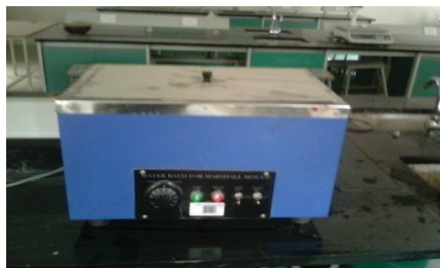
Figure 3.1 Steam curing unit

Curing may be done either by steam curing or water curing, in this present study curing of aggregates can be done by 28 days water curing.