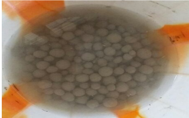
Figure 3.1.2 Water curing