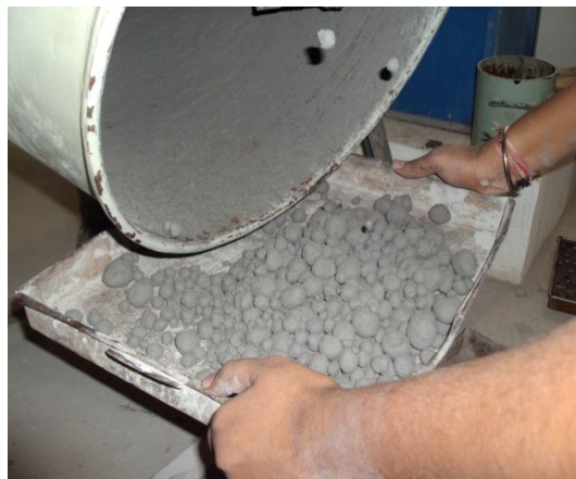
Figure 3. Collection of fly ash aggregates from mixer

The contents were thoroughly mixed in concrete mixer until the formation of fly ash aggregate. The method of formation is called pelletisation. Once the aggregate formed from the mixer allowed to dry for a day dried aggregate carried for 7, 28 days for water curing and two days of steam curing at 80 degrees C is carried.