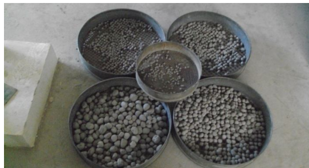
Figure 4. Segregation of fly ash aggregates.

After curing, fly ash aggregates were segregated into fine and coarse aggregates based on the size of the pellets shown in the figure. The aggregates having size less than 4.75mm were sieved as fine aggregates and size more than 4.75 mm were sieved as coarse aggregates. The aggregate below 20 mm size sieve used in the concrete specimen as a filler material